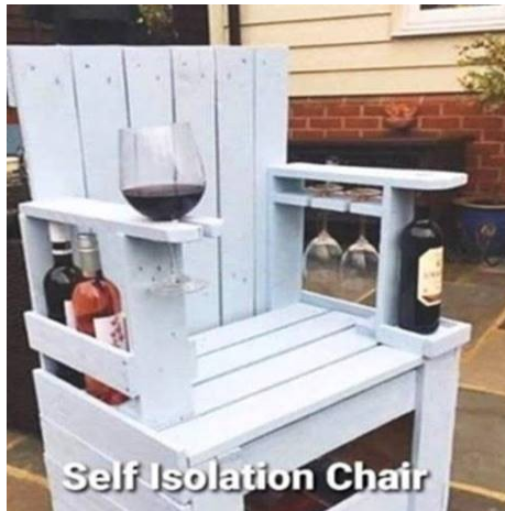
Self Isolation Chair