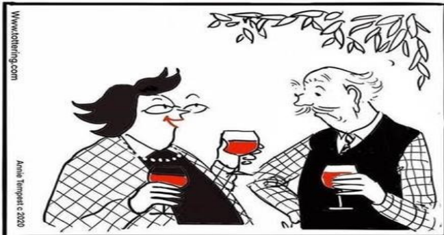
"It's just that I find that having two glasses of wine at once stops me touching my face..."